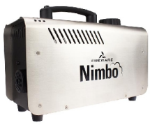
001-012-001 FireWare Nimbo Smokemachine