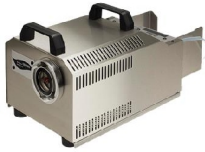
002-012-001 FireWare Cumulus Smokemachine