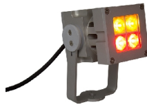
027-090-003 FireWare FireSpot