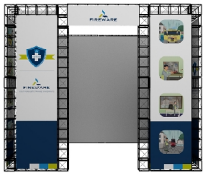
010-012-001 FireWare Interactive Incident Trainer (F.I.T.T.)