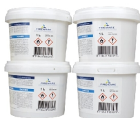
029-030-002 FireWare Low Smoke Flammable Gel 4x 1 L