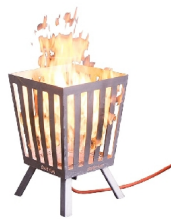
049-092-001 BF Hybrid FireTrainer