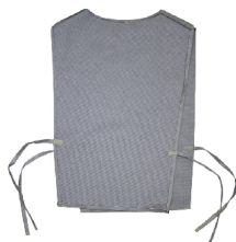
017-062-006 Silver Vest for Fire Manikin