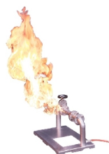
049-012-001 FireWare Vesta