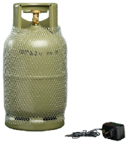
025-027-004 Sizzling Practice Gascylinder Green