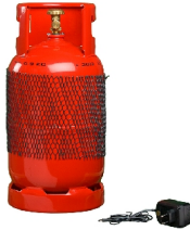
025-027-003 Sizzling Practice Gascylinder Red