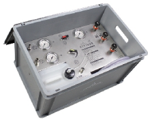
025-012-007 FireWare Neptune Fillingsystem