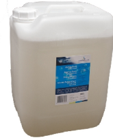
025-014-003 FireWare Practice Foam 20 L