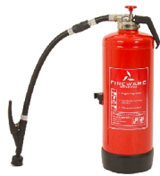
025-100-100 FireWare Neptune Training Fire Extinguisher Push Button 6 L