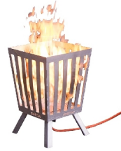
049-092-012 Solid Firetrainer