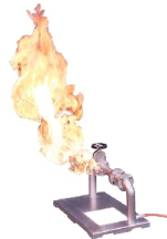
049-012-013 Stand-alone Flange Fire