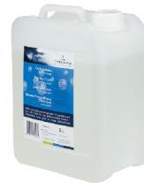
025-014-001 FireWare Practice Foam 5 L