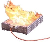
049-092-001 BF Hybrid FireTrainer