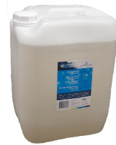
025-014-003 FireWare Practice Foam 20 L