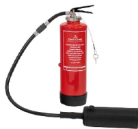
025-100-099 FireWare Neptune Training Fire Extinguisher Squeeze Handle 6 L