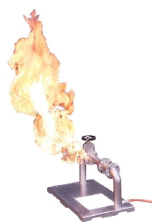
049-012-013 Stand-alone Flange Fire