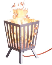
049-092-012 Solid Firetrainer