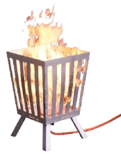
049-092-012 Solid Firetrainer