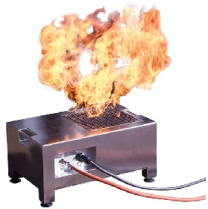
049-012-001 FireWare Vesta