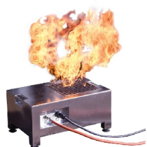
049-012-001 FireWare Vesta