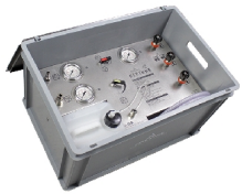
025-012-007 FireWare Neptune Fillingsystem