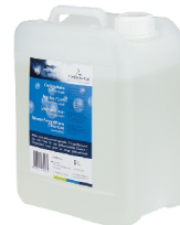
025-014-001 FireWare Practice Foam 5 L