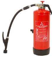
025-100-100 FireWare Neptune Training Fire Extinguisher Push Button 6 L