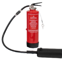
025-100-099 FireWare Neptune Training Fire Extinguisher Squeeze Handle 6 L