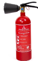
025-100-103 FireWare Apollo LED CO2 Training Fire Extinguisher 2 L