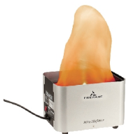
011-012-008 FireWare Mini-Silkflame LED