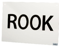
027-028-012 Traditional "Rook" Sign