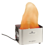
011-012-008 FireWare Mini-Silkflame LED