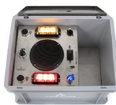
025-012-036 FireWare Pandora's Box