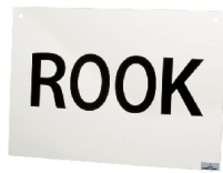
027-028-012 Traditional "Rook" Sign