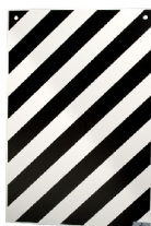
027-028-010 Traditional Blocking sign