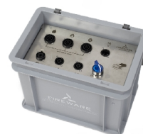
025-012-041 Pandora's Box 230