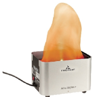
011-012-008 FireWare Mini-Silkflame LED