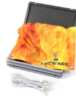
027-028-005 Flame curtain Traditional