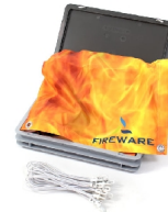
027-028-005 Flame curtain Traditional