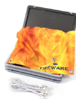
027-028-005 Flame curtain Traditional