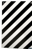
027-028-010 Traditional Blocking sign