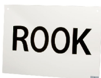
027-028-012 Traditional "Rook" Sign