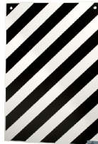
027-028-010 Traditional Blocking sign