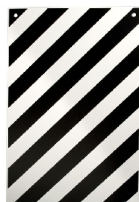
027-028-010 Traditional Blocking sign