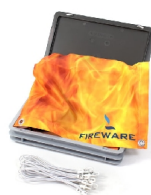
027-028-005 Flame curtain Traditional