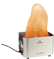
011-012-008 FireWare Mini-Silkflame LED