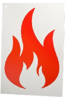
027-028-009 Traditional Flame Sign