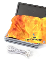
027-028-005 Flame curtain Traditional