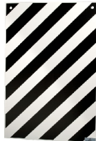
027-028-010 Traditional Blocking sign