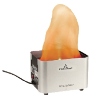
011-012-008 FireWare Mini-Silkflame LED