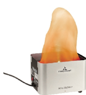
011-012-008 FireWare Mini-Silkflame LED