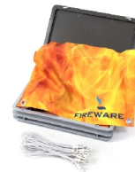
027-028-005 Flame curtain Traditional