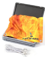
027-028-005 Flame curtain Traditional