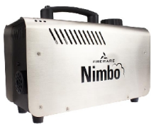
001-012-001 FireWare Nimbo Smokemachine