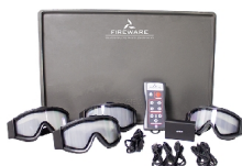
025-021-013 FireWare Nebula AR Smoke Simulation Mask Maxi-set