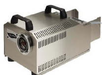
002-012-001 FireWare Cumulus Smokemachine