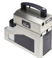
003-012-001 FireWare Cirrus Smokemachine with Battery