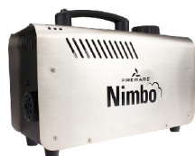
001-012-001 FireWare Nimbo Smokemachine