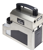
003-012-001 FireWare Cirrus Smokemachine with Battery