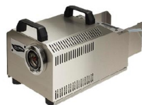
002-012-001 FireWare Cumulus Smokemachine