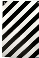
027-028-010 Traditional Blocking sign