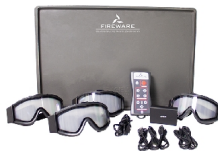
025-021-013 FireWare Nebula AR Smoke Simulation Mask Maxi-set