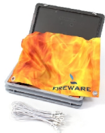
027-028-005 Flame curtain Traditional