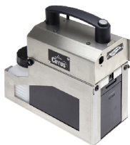
003-012-001 FireWare Cirrus Smokemachine with Battery