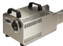
002-012-001 FireWare Cumulus Smokemachine