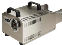
002-012-001 FireWare Cumulus Smokemachine