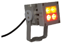
027-090-003 FireWare FireSpot