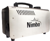
001-012-001 FireWare Nimbo Smokemachine