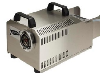
002-012-002 FireWare Stratus Smokemachine