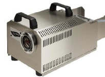
002-012-002 FireWare Stratus Smokemachine