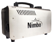
001-012-001 FireWare Nimbo Smokemachine