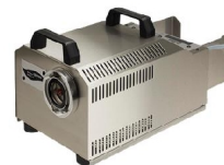
002-012-002 FireWare Stratus Smokemachine