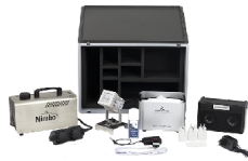
040-030-032 Fire Simulation Kit V4 - NL