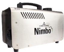
001-012-001 FireWare Nimbo Smokemachine