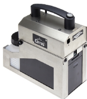
003-012-001 FireWare Cirrus Smokemachine with Battery