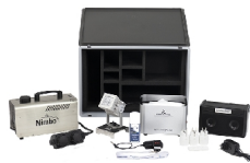
040-030-032 Fire Simulation Kit V4 - NL