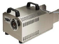
002-012-001 FireWare Cumulus Smokemachine