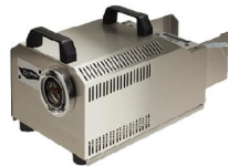
002-012-001 FireWare Cumulus Smokemachine