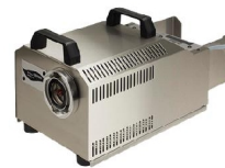
002-012-002 FireWare Stratus Smokemachine