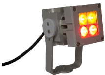
027-090-003 FireWare FireSpot