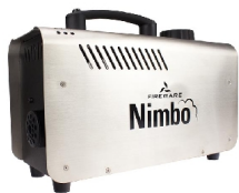
001-012-001 FireWare Nimbo Smokemachine