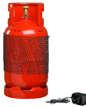
025-027-003 Sizzling Practice Gascylinder Red