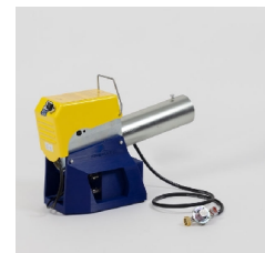
025-026-020 Explosion Simulator with remote