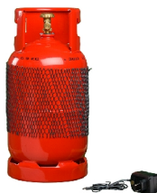
025-027-003 Sizzling Practice Gascylinder Red