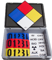
028-030-009 NFPA (hazard rating) Diamant Set Magnetic