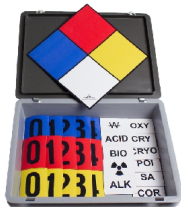
028-030-009 NFPA (hazard rating) Diamant Set Magnetic