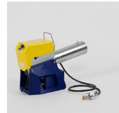
025-026-020 Explosion Simulator with remote