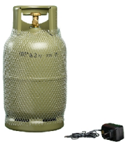
025-027-004 Sizzling Practice Gascylinder Green