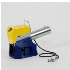
025-026-020 Explosion Simulator with remote