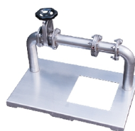
049-012-002 Add-on Flange Fire