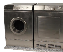
049-012-017 Add-on Wash Dry Combination