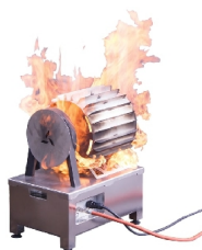
049-012-005 Add-on Electric Motor