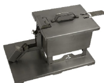
049-012-031 Add-on Fryer