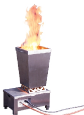
049-012-006 Add-on Garbage Bin