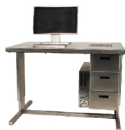
049-012-018 Add-on Desk with Computer