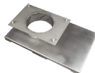
049-012-019 Add-on Adapter Vesta > Haagen