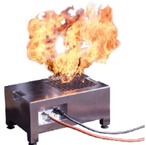
049-012-001 FireWare Vesta