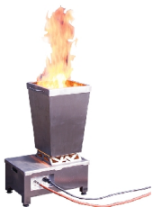
049-012-006 Add-on Garbage Bin