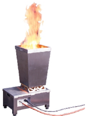
049-012-006 Add-on Garbage Bin