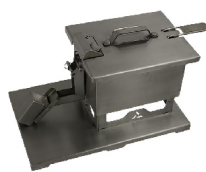
049-012-031 Add-on Fryer