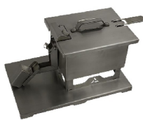
049-012-031 Add-on Fryer