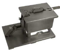
049-012-031 Add-on Fryer