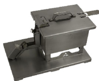
049-012-031 Add-on Fryer