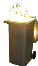
049-012-008 Add-on Wheeled Bin