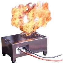
049-012-001 FireWare Vesta