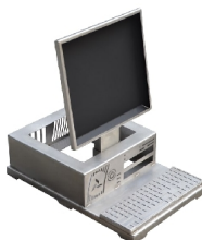
049-012-042 Add-on Computer