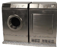
049-012-017 Add-on Wash Dry Combination