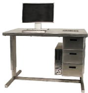
049-012-018 Add-on Desk with Computer