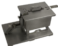
049-012-031 Add-on Fryer