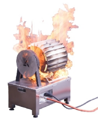
049-012-005 Add-on Electric Motor