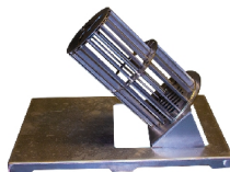
049-012-038 Add-on Explosion Cage