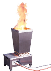
049-012-006 Add-on Garbage Bin