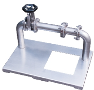
049-012-002 Add-on Flange Fire