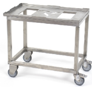
049-012-046 Vesta Trolley