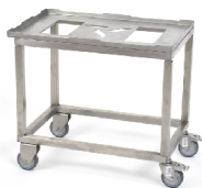
049-012-046 Vesta Trolley