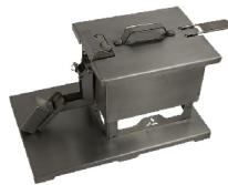
049-012-031 Add-on Fryer