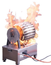
049-012-005 Add-on Electric Motor