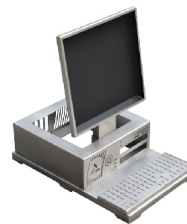
049-012-042 Add-on Computer