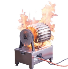
049-012-005 Add-on Electric Motor