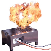
049-012-001 FireWare Vesta