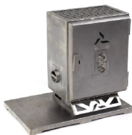
049-012-048 Add-on Electrical Cabinet