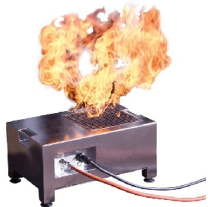
049-012-001 FireWare Vesta