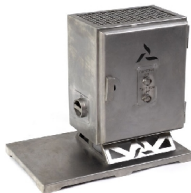
049-012-048 Add-on Electrical Cabinet