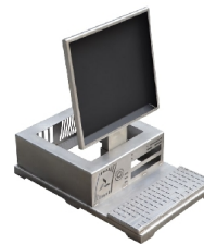
049-012-042 Add-on Computer