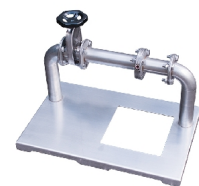
049-012-002 Add-on Flange Fire