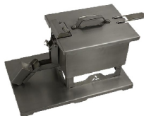
049-012-031 Add-on Fryer