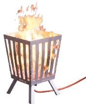
049-092-012 Solid Firetrainer